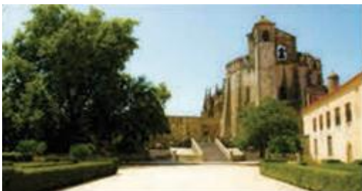
iConvento de Cristo

These graceful “dancing horses” are one of the oldest horse breeds in the world, renowned for their bull-fighting heritage